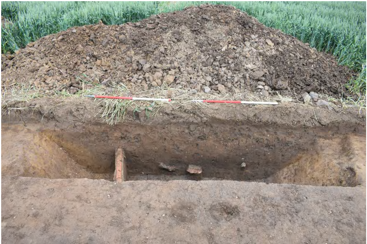
Plate 4.31: Trench 249. Ditch [24905] with recuts [24906] and [24907], looking east.