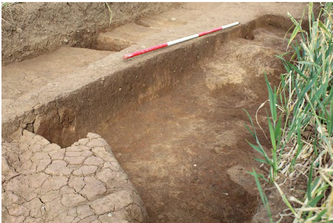
Plate 5.9 Trench 269. Section of extraction pits [26941] and [26942].