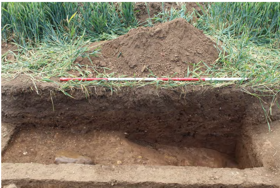
Plate 5.16 Trench 269. East-facing section of ditch [26932] sealed by deposit (26940).