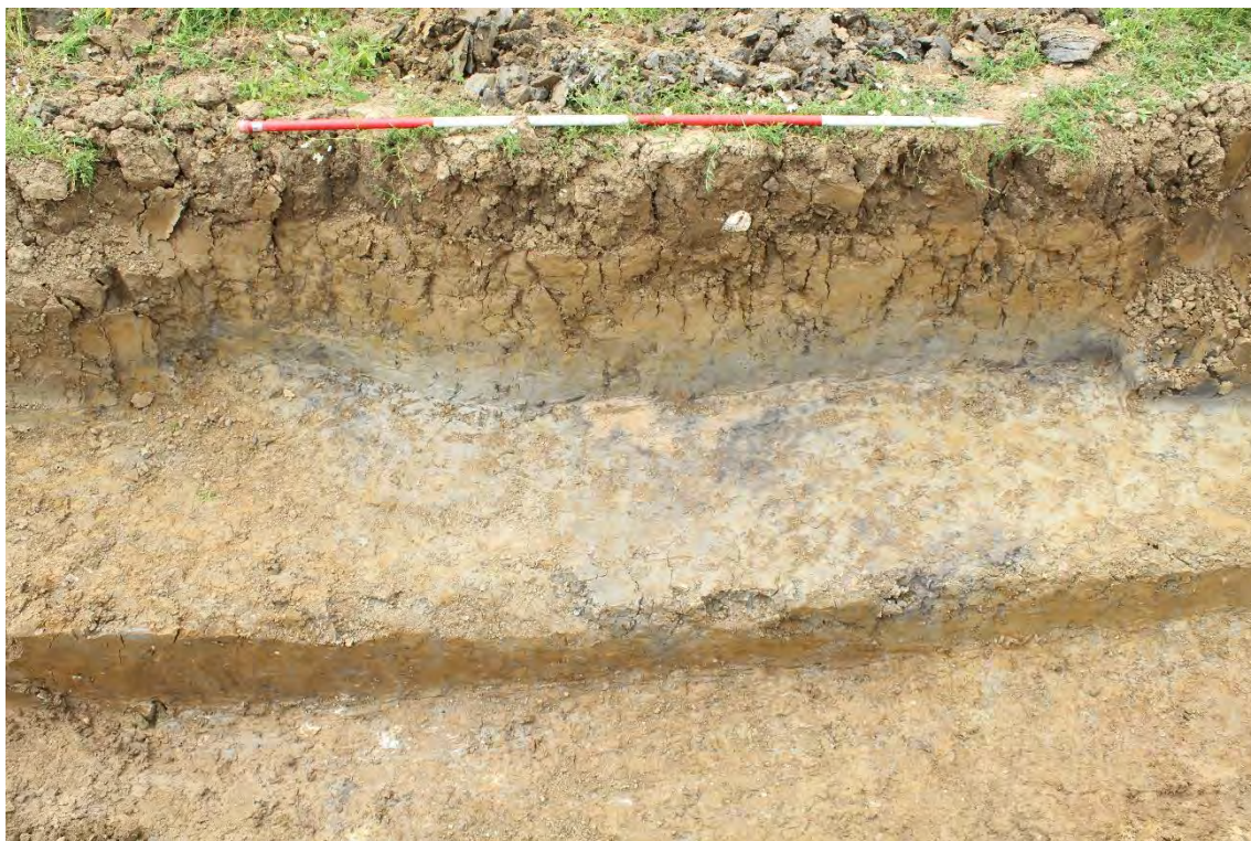
Plate 6.7: Trench 284. A sequence of water lain deposits in the southern half of Trench 284. Looking northwest.