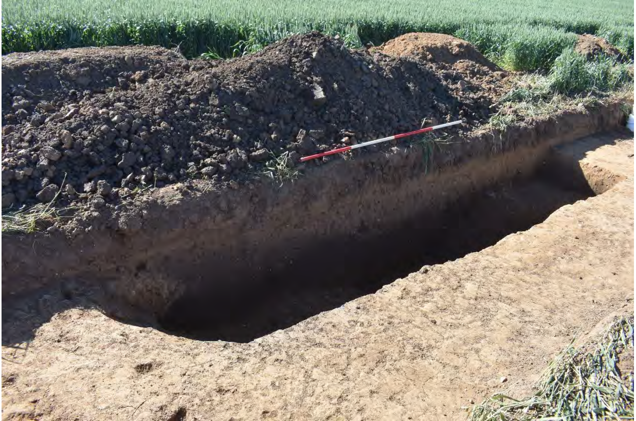
Plate 4.30: Trench 248. Oblique view of ditches [24802] and [24805], looking southeast.