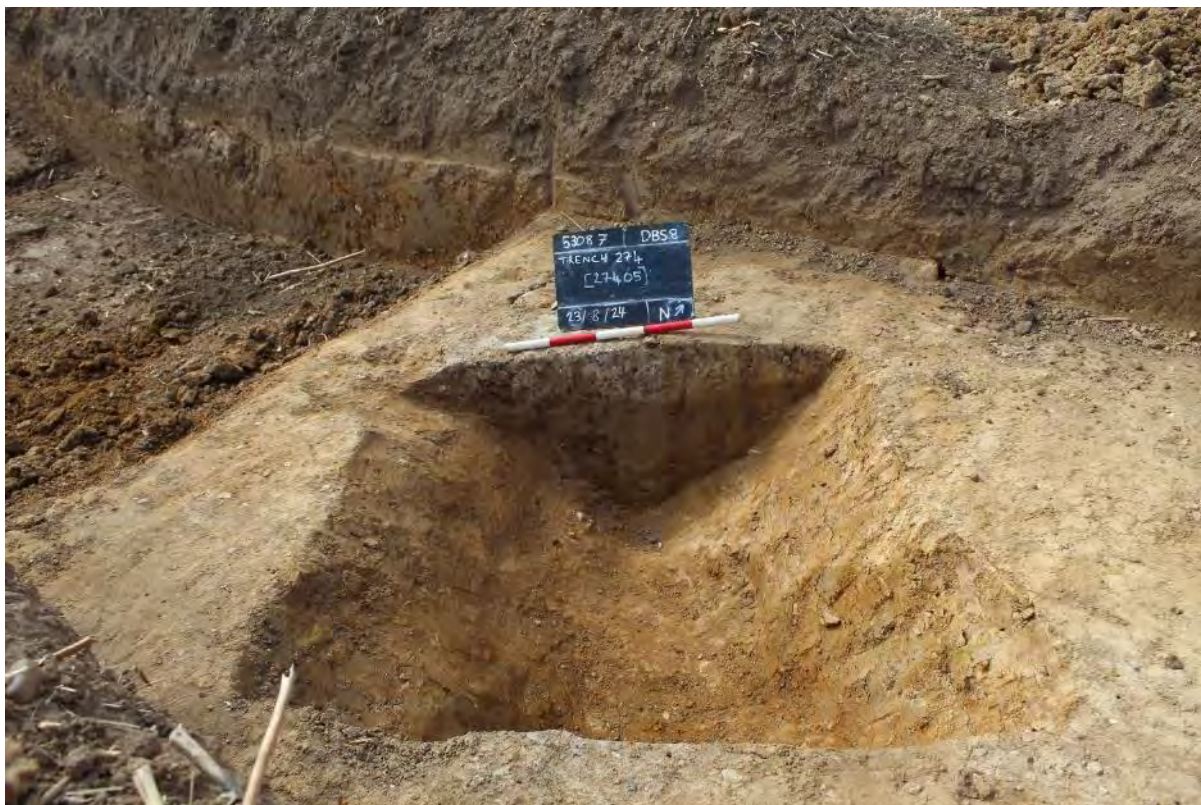
Plate 5.23 Trench 274. Ditch [27405], looking northwest