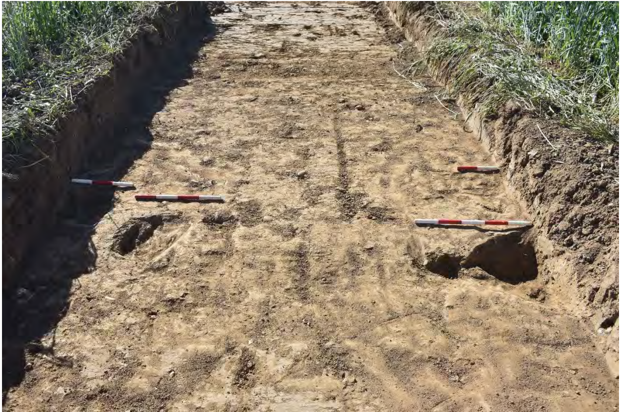
Plate 4.33: Trench 250. Plan shot of pits [25002], [25004], [25006] and [25008]. Looking west.