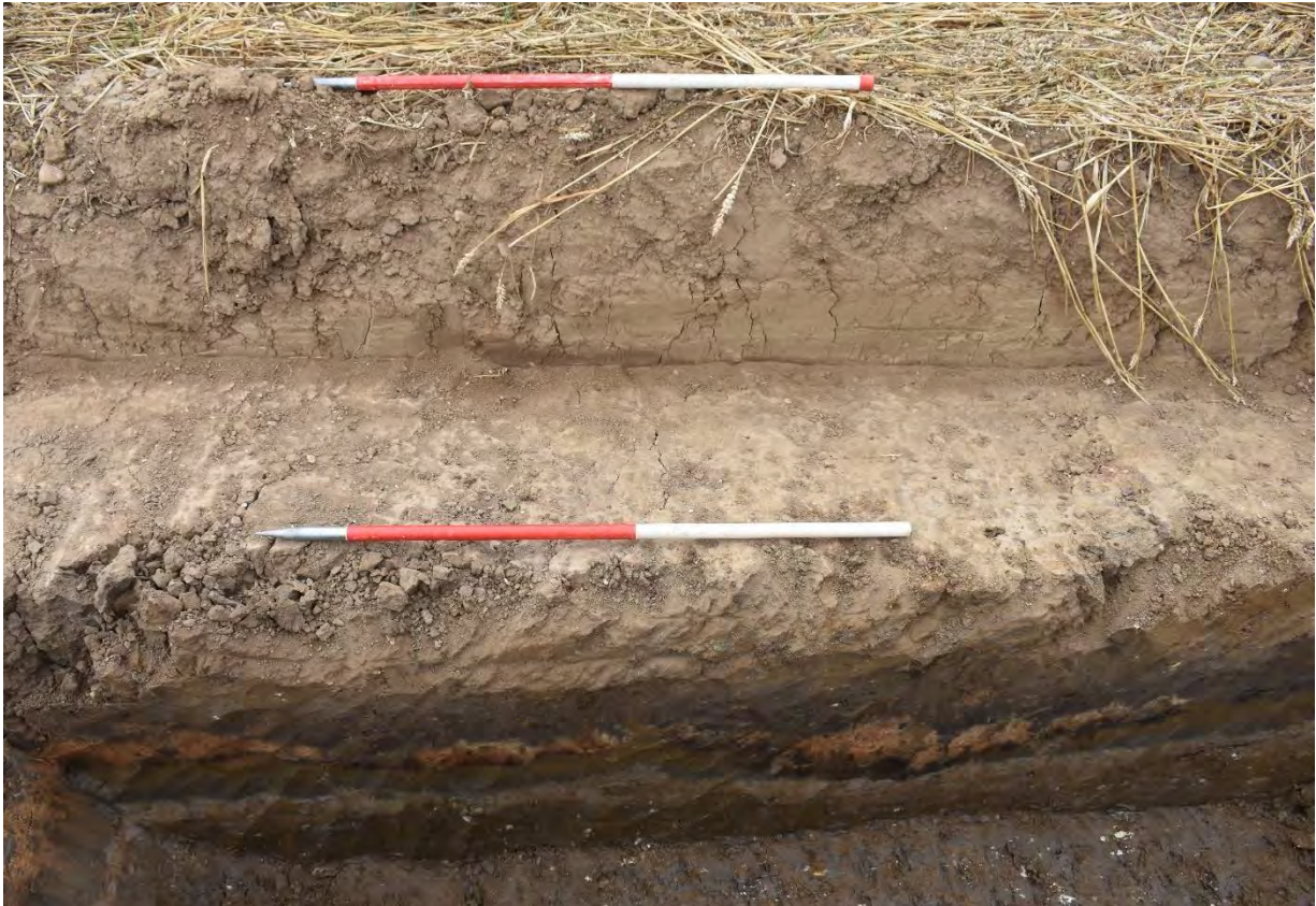
Plate 4.3: Trench 227. Section showing deposit sequence at west end. Looking south.