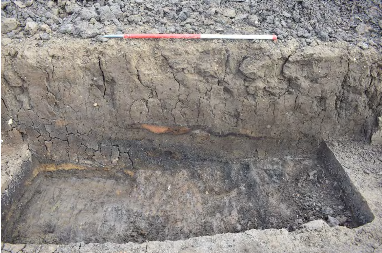
Plate 4.4: Trench 227. Section showing deposit sequence at east end with burnt deposits (22711) and (22712). Looking north.