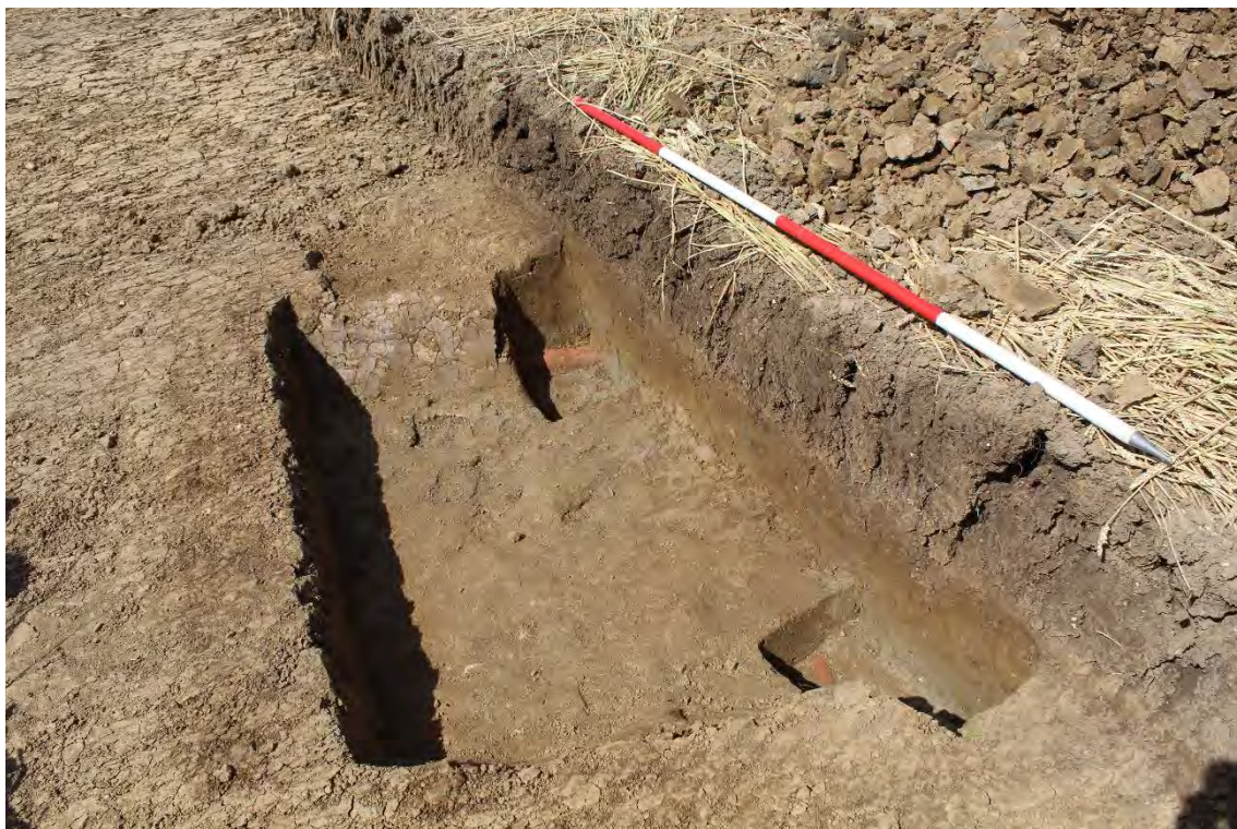
Plate 6.3: Trench 304. Furrow [30403] truncating earlier water lain deposits. Looking northeast.