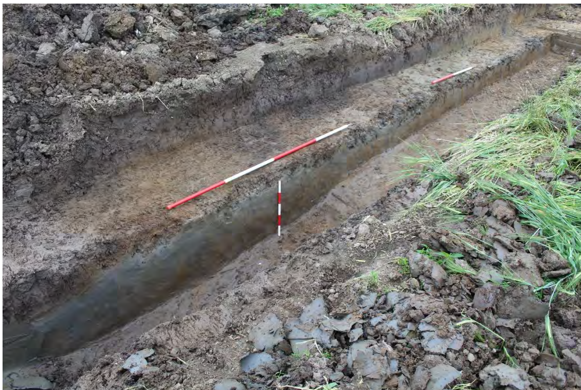
Plate 6.15: Trench 287. Pond feature in [28705] with sequence of blue-grey water lain clays and plant debris. Looking south.