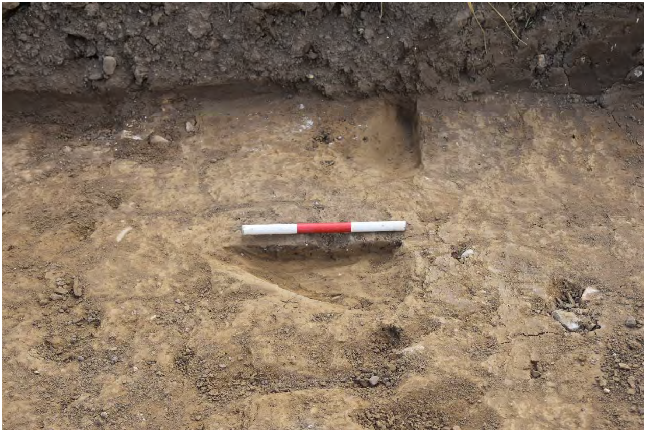
Plate 4.34: Trench 250. Pit [25004], looking northeast.