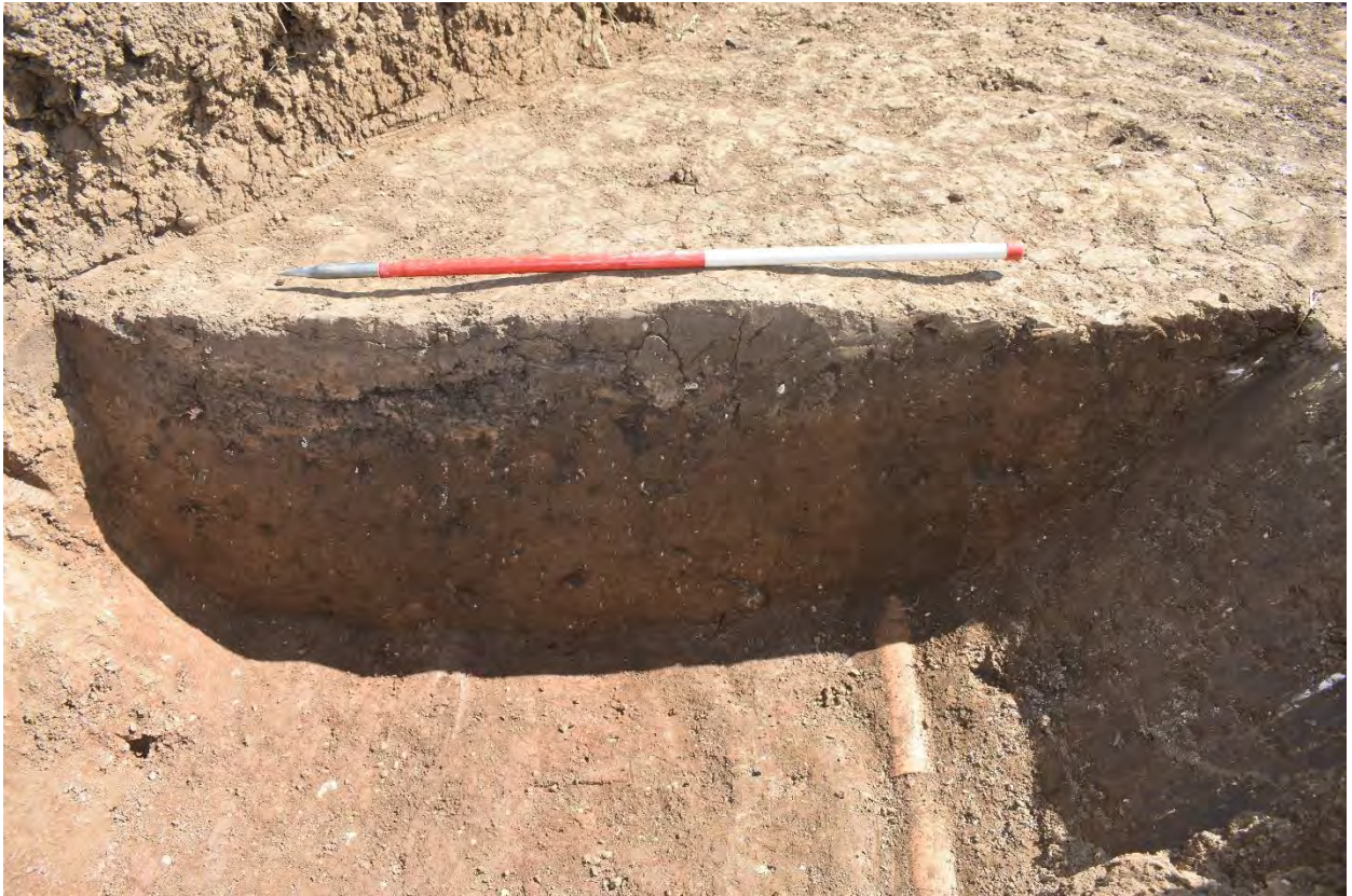
Plate 4.26: Trench 235. Ditch [23503], looking southeast.